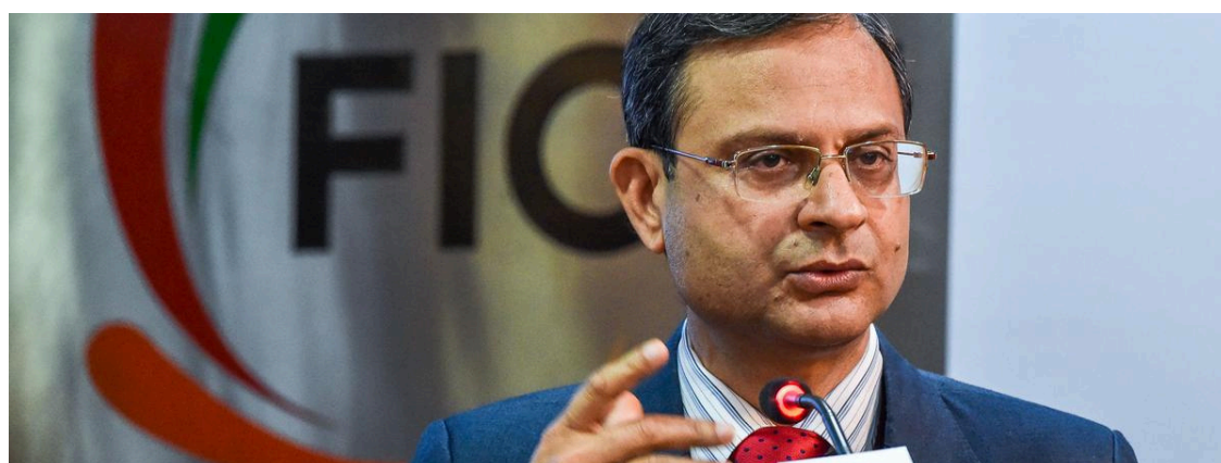
Sanjay Malhotra, the 26th Governor of the Reserve Bank of India

Having graduated from the Indian Institute of Technology, Kanpur, with a degree in computer science engineering and a Master's degree in Public Policy from Princeton