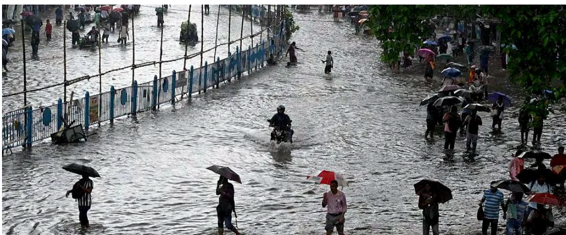
Many key roads in Kolkata city were inundated

The sheer intensity of the monsoon rains, coupled with a high tide in the