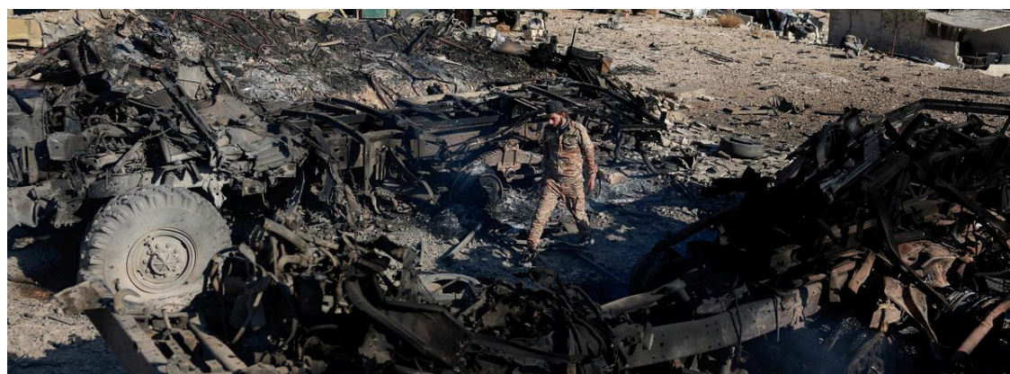
A fighter of the ruling Syrian body inspects the damage at a military site

The Syrian Observatory for Human Rights reported that Israeli strikes targeted a "military airport" in the countryside of the capital and "destroyed a scientific institute" along with other