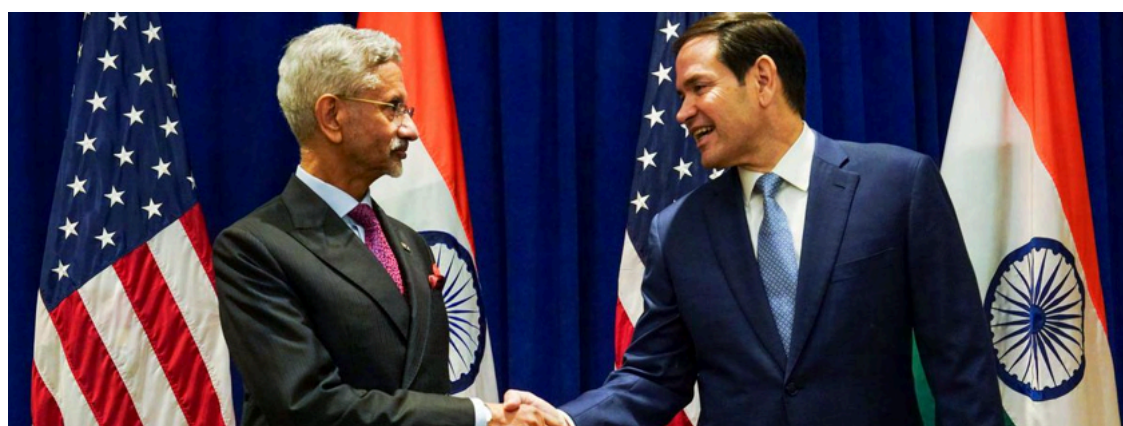
U.S. Secretary of State Marco Rubio shakes hands with External Affairs Minister S. Jaishankar at the Lotte New York Palace Hotel

In a significant diplomatic exchange, External Affairs Minister S. Jaishankar met with U.S. Secretary of State Marco Rubio on September 22, on the sidelines of the 80th United Nations General Assembly (UNGA).