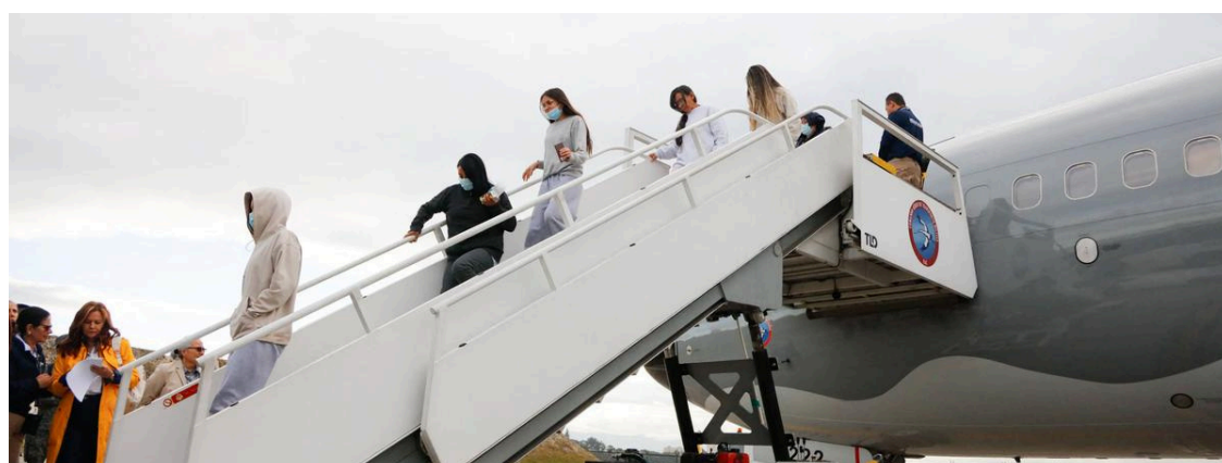
Migrants descending from a Colombian Air Force plane

"For the first time in history, we are locating and loading illegal aliens into military aircraft and flying them back to the places from which they came," Trump told the crowd.