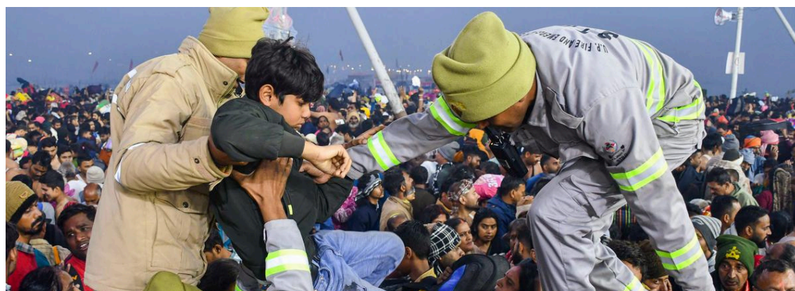
A devotee being rescued following a stampede

A stampede at the Maha Kumbh in Prayagraj on January 29 morning, shortly before the important "Amrit Snan" on Mauni Amavasya, left at least 30 people dead and 60 injured.